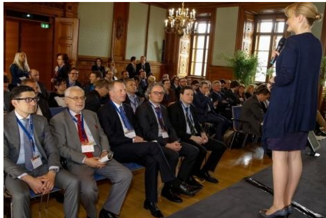
From 20 to 21 May 2015 - the third edition of GREET Vienna "Global Real Estate & Economy Talks"

From 20 to 21 May 2015 already the third edition of GREET Vienna "Global Real Estate & Economy Talks" is taking place - the international platform for commercial real estate and investments with special focus on Central, Eastern and South Eastern Europe. The venue is the Palais Niederösterreich in the city centre of Vienna.